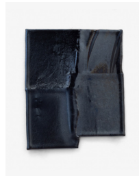
Black Mirror Study I , 2025 Kilnformed glass 9 7/8 x 8 1/8 x 1/4 in. 25.1 x 20.7 x 0.6 cm.