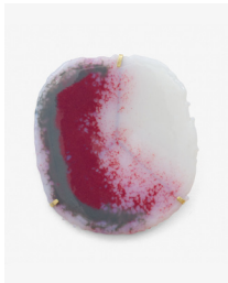
Studio Construction I , 2025 Kilnformed glass 10 3/4 x 9 3/4 x 1/2 in. 27.3 x 24.8 x 1.3 cm.