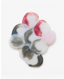
Untitled Construction II , 2026 Kilnformed glass 13 1/4 x 11 1/2 x 1/4 in. 33.7 x 29.2 x 0.6 cm.