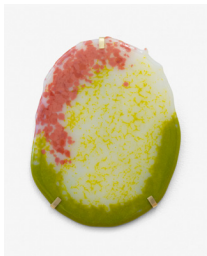
Studio Construction VI , 2025 Kilnformed glass 9 1/2 x 7 3/4 x 1/4 in. 24.1 x 19.7 x 0.6 cm.