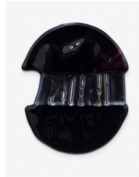
Pink Moon II , 2025 Kilnformed glass 7 3/4 x 6 1/4 x 1/4 in. 19.7 x 15.9 x 0.6 cm.