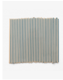
Stripe Piece , 2019–2025 Kilnformed glass 18 1/4 x 19 1/4 x 1/4 in. 46.4 x 48.9 x 0.6 cm.