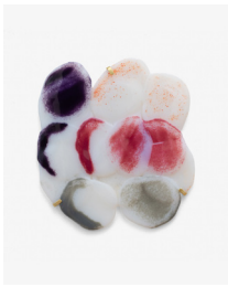
Untitled Construction I , 2025 Kilnformed glass 12 x 11 x 1/4 in. 30.5 x 27.9 x 0.6 cm.