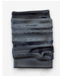
Black Mirror Study IV , 2025 Kilnformed glass 7 1/4 x 5 x 1/4 in. 18.4 x 12.7 x 0.6 cm.