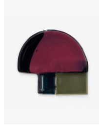
Pink Moon I , 2025 Kilnformed glass 5 7/8 x 6 1/2 x 1/4 in. 14.9 x 16.5 x 0.6 cm.