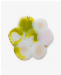
Untitled Construction III , 2026 Kilnformed glass 10 x 10 x 1/4 in. 25.4 x 25.4 x 0.6 cm.