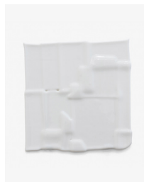
White Mirror , 2025 Kilnformed glass 11 1/2 x 11 1/2 x 1/4 in. 29.2 x 29.2 x 0.6 cm.