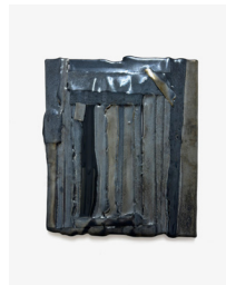
Black Mirror , 2023 Kilnformed glass 12 1/2 x 10 3/4 in. 31.8 x 27.3 cm.