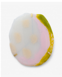
Studio Construction VII , 2026 Kilnformed glass 9 x 7 1/2 x 1/4 in. 22.9 x 19.1 x 0.6 cm.