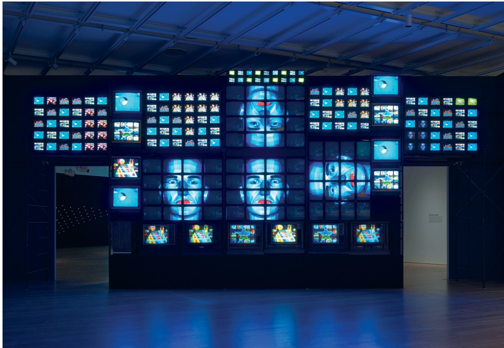
Nam June Paik, Fin de Siècle II , 1989/2018, seven-channel video installation with 207 televisions, 14' x 40' x 5'. Whitney Museum.

eggshells, felt, sealant, fabric, and multicolored spools semaphore bodies in disarray—the show built on the artist’s experience of living with a chronic illness—where the rib cage might be intact but the organs it protects are all askew. Viewing them creates a visceral sensation of being all powdery inside or of having a mouth full of cotton wool.