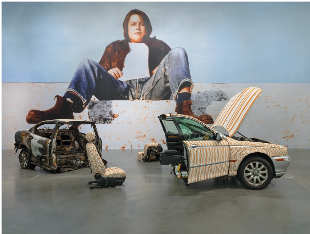
Installation view of “ Sarah Lucas ( https://www.artnews.com/t/sarah-lucas/ ): Au Naturel ,” 2018, at New Museum ( https://www.artnews.com/t/new-museum/ ), New York.

Monitor-based sculpture gets a showing here too, in yet another Paik, Magnet TV (1965), which does exactly what the wall text says: a heavy magnet on top of a black-and-white monitor’s casing creates a gorgeous moiré sculpture onscreen by interfering with the TV’s electronic signals to distort the broadcast image. Especially seductive in this line is Earl Reiback ( https://www.artnews.com/t/earl-reiback/ )’s Thrust (1969), a phosphor-coated screen mounted perpendicularly to the face of a cathode ray tube altering the translation from electron beam to image, making it look like a phosphorescent, bisected iris and pupil. Or perhaps that’s just our brains on television.